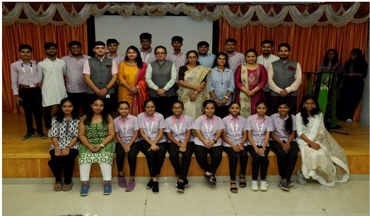
FIRST YEAR BACHELORS OF COMMERCE