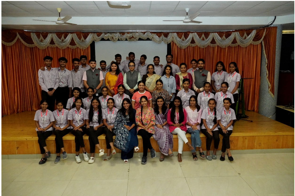
SECOND YEAR BACHELORS OF COMMERCE