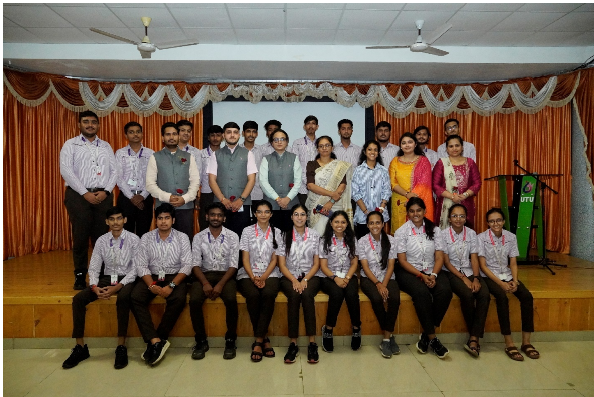
THIRD YEAR BACHELORS OF COMMERCE