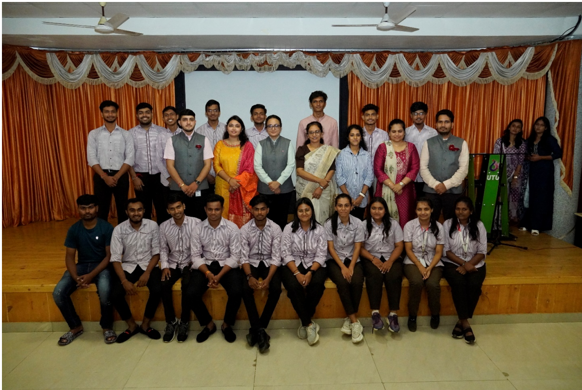
MASTERS OF COMMERCE (I & II)